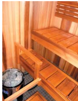
Sauna interior image provided by: Sauna King Systems, Inc.

Various activities we can do to reduce stress levels in our bodies include: breathing exercises, listening to relaxing music, walking, dancing, reading, meditation and getting a massage, to name a few. Indulging ourselves in a relaxing sauna, hot tub or steam bath for an hour or two will not only help us clear our minds and look better, but will have a direct affect on our overall body health so we feel better, too.